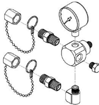
EZ Find™ Dual Port Retrofit Assembly Above