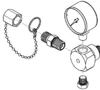
EZ Backfeed® Retrofit Assembly Above