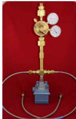
Model PX-TSDWPHP-580 with PX-PS-160-3200 pressure switch shown with optional pressure switch above