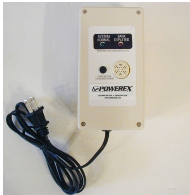
Model PX-TAV-1 Shown above Optional remote audio visual alarm must be used with optional pressure switch

Ideal for veterinary applications where manual switching of cylinders and a possible interruption of gas service are allowable. Systems are available for nitrous oxide, carbon dioxide, nitrogen, medical air and oxygen.