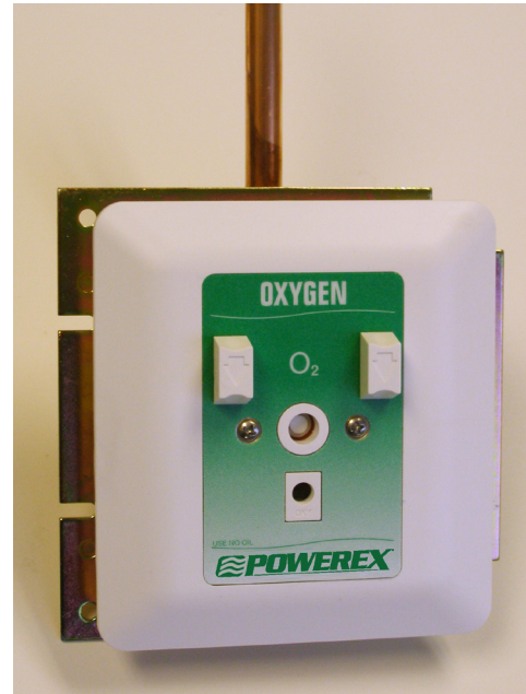
Part Number PX-XA1124 shown

The name of the gas service shall be permanently marked on the outlet bracket and the outlet. The outlet's rough-in supply tube shall be a 7 inch (18 cm) length of ½ OD copper