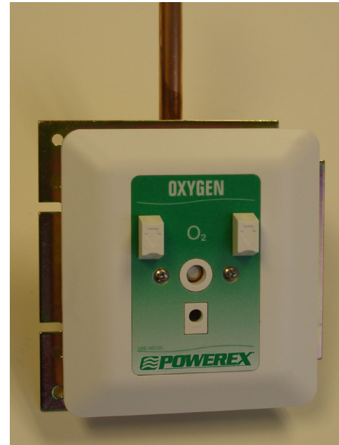
Part Number PX-XA1124 shown

The name of the gas service shall be permanently marked on the outlet bracket and the outlet. The outlet's rough-in supply tube shall be a 7 inch (18 cm) length of ½ OD copper